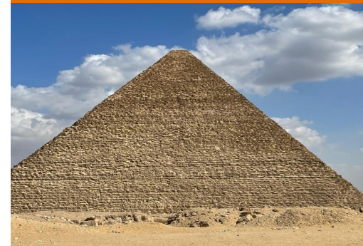
The Great Pyramids of Giza

Experience the healing vortex in the Mother Land