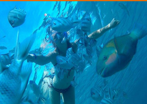
Snorkeling in the Red Sea, Hurghada